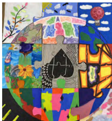
Collinstown Park CC 5th year Art class

Aidan Flannery, Skerries CC - Piano Composition