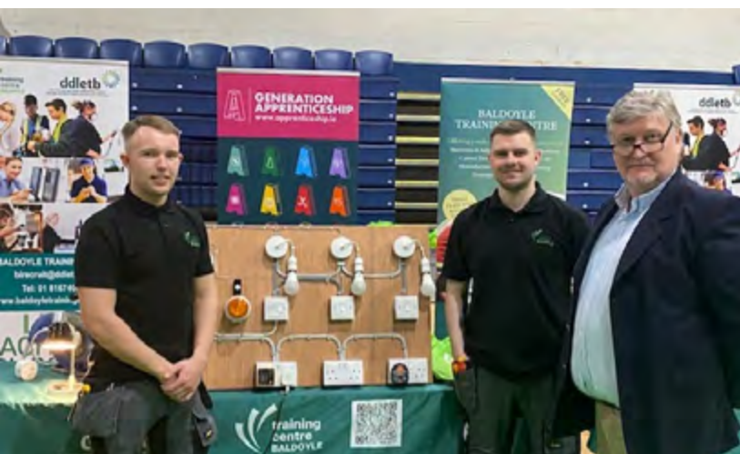
Baldoyle Training Centre's Electrical Apprentices and their instructor at the INTREO Construction Jobs, Apprentices and Training Expo at the NBA in Tallaght.

Baldoyle Training Centre and Loughlinstown Training Centre recently attended the INTREO Construction Jobs, Apprenticeships and Training Expo in Tallaght Stadium.