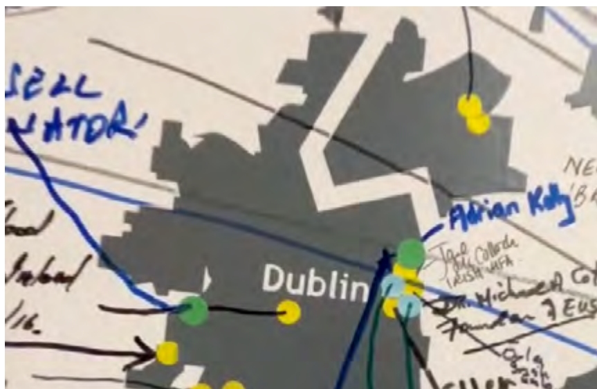
#HKHK #FlexLearn #Erasmus+ #digitallearning #ddletb