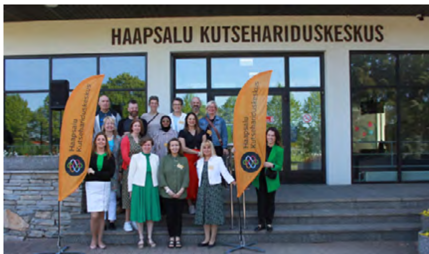
Haapsalu Vocational Education and Training Centre (HKHK) where our program was based.