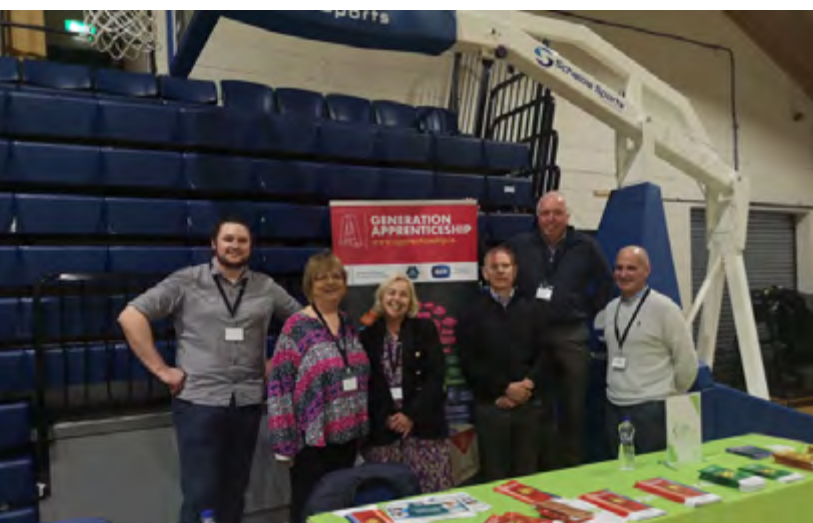
Our Loughlinstown team at Apprenticeship & Training Expo in National Basketball Arena.

We are proud of our apprentices and their instructors who represented DDLETB Training Centres with professionalism and enthusiasm at the expo.