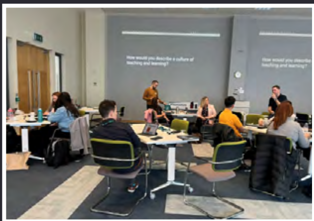
Workshop no. 1 held in DDLETB Head Office

Two full day, practical in-person, workshops were delivered by Apple Professional Learning Specialists who are also experienced educators.