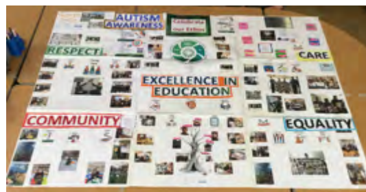
The Gareth Suite, Grange CC