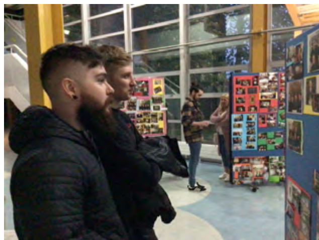
Former FCC pupils examining the archive display on the evening of celebration.