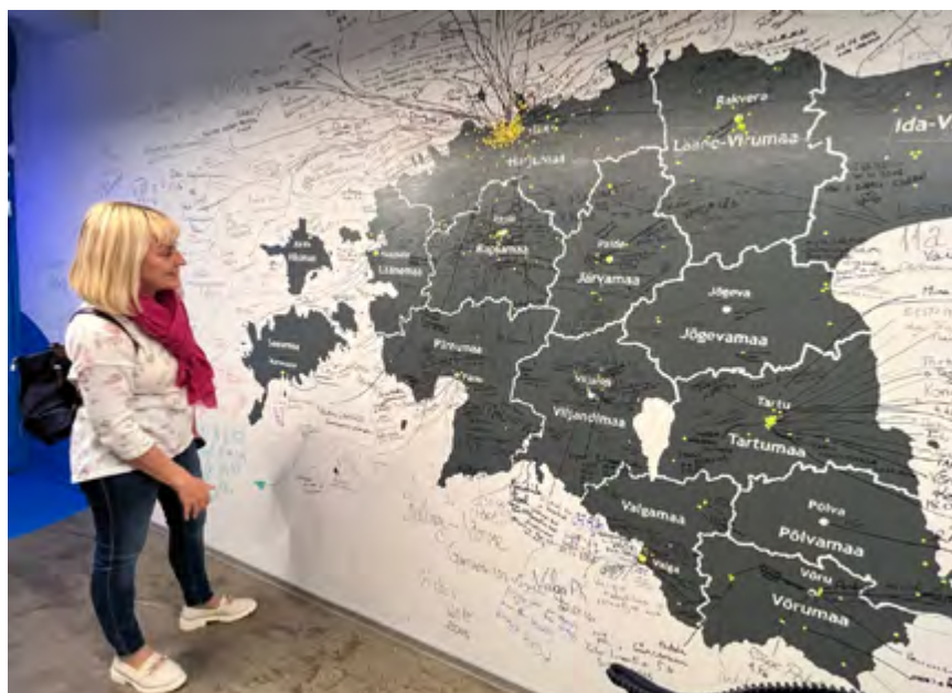
#Teamddletb signing the visitor wall in TalTech!