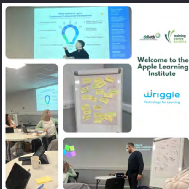
Workshop no.2 held in Baldoyle Training Centre

The second session was held in Baldoyle Training Centre on April 28th. This collaborative session focused on designing a comprehensive Digital Learning Plan tailored to meet the unique digital learning needs of our schools.