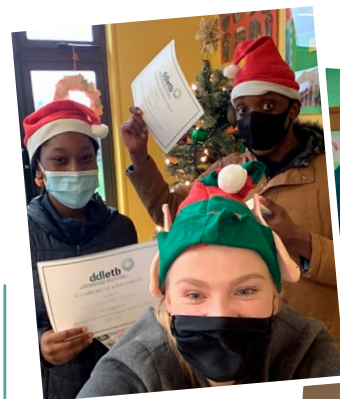
Kishoge CC students

Session six: Cambridge Teaching Knowledge Test CLIL live exam held on premises in Donabate CC