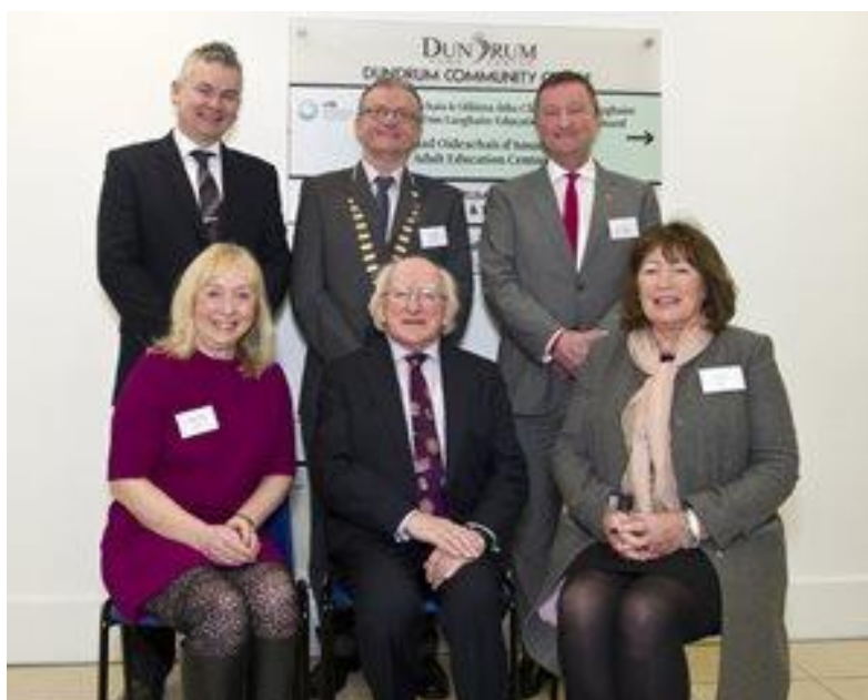
President Michael D. Higgins Launches “DATE Dundrum Adult Training and Education Celebrating 30 Years”

DDLETB FET provision offers full and part-time courses in a wide range of fields to a large and diverse population of post second level learners. Programmes include Apprenticeship, Blended Learning, Bridging/Foundation Courses, Community Training Centre provision, Justice Workshops, Local Training Initiatives, PLC, Specialist Training, Specific Skills Training, Traineeship Training, VTOS, Youthreach, Adult Literacy, BTEI, Community Education, ESOL, Evening Training, FET Cooperation Hours, ITABE and Skills for Work.