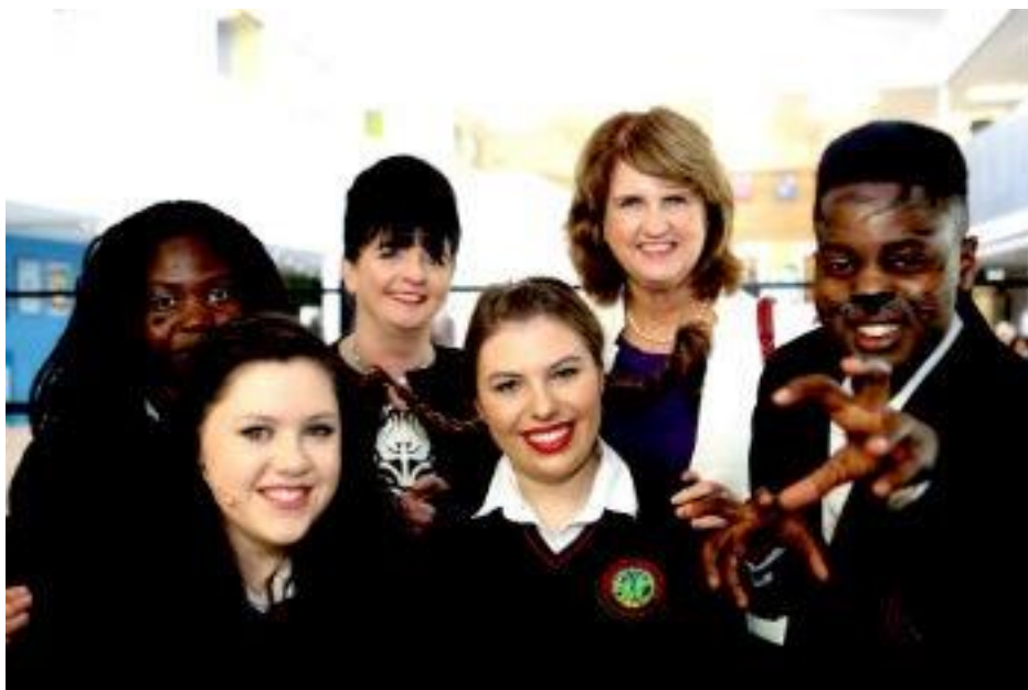
Tánaiste Joan Burton visits Luttrellstown Community College for their production of Hairspray